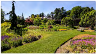
Elm Bank (above) Tower Hill (below)