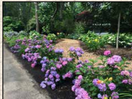
Hydrangeas at Heritage Gardens