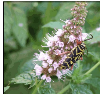
Locust Borer ( Megacyllene robiniae )

vealed that the "bee" was a long-horned beetle known as a Locust Borer. Its coloration resembles a yellowjacket wasp. Continued p.2