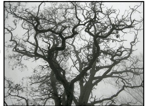
Black Locust in Winter

(1) "It is estimated that humans move 7,000 species a day," and (2) "Many crops [in the U.S.] are pollinated by honeybees originally introduced from Europe."